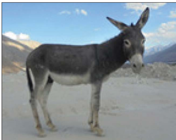
Fig. 5. Typical Ladakhi donkey-male