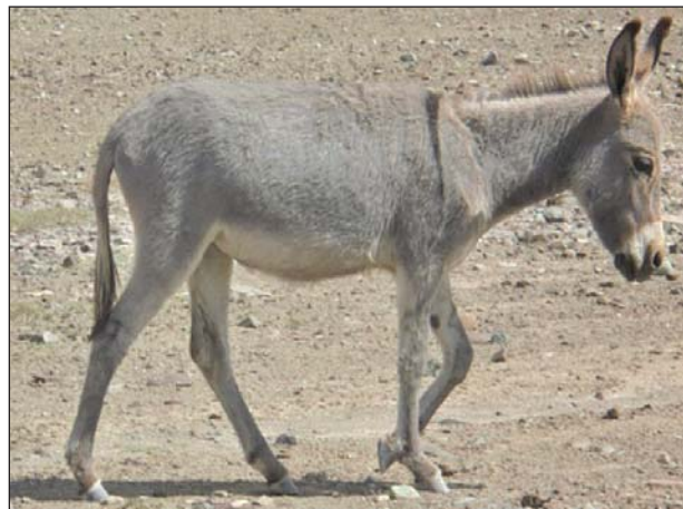
Typical Ladakhi donkey-female