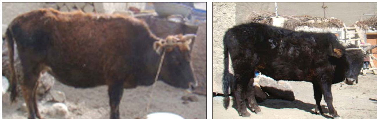
Fig. 2. Typical Ladhaki Cow and Typical Ladhaki Bull

The churpi and butter made up of yak milk is quite popular amongst nomads and local Ladakhi people. Apart from source of quality milk, yak is also reared for hair fiber. Additionally, its utility as a pack animal for snow-bound areas has also been widely recognized. Apart from Ladakh, the yak population in India is also present in Sikkim, Arunachal Pradesh and Himachal Pradesh. In addition to pure yak, yak-cattle hybrids