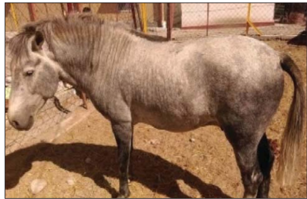
Fig. 4. Typical Zanskari pony

Ladakh is also endowed with local equine population called Zanskari ponies due to their major distribution in the Zanskar valley of Ladakh. The body height ranges between 132–147 cm. These ponies look like a small horse with stocky body, exhibit thicker manes, shorter legs, wider barrels heavier hair coat, long tail and heavier bones. The predominant colors are grey, brown and bay. The body confirmation of ponies is most suitable for balancing while riding and load carrying. These ponies have proved their stamina as hardy pack animals with minimum maintenance, during operation Vijay and are called as ‘trucks of the mountains. Hence, due to their suitability as pack animals, these ponies are valuable for deployment as all-terrain vehicles in Ladakh-sector and other high mountainous areas. A typical animal of Zanskari pony is shown in Fig. 4.