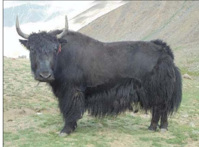
Fig. 3. Typical Ladakhi yak male and Typical Ladakhi yak female

are generally reared at mid region of Ladakh (3500 to 4000 m msl). Most of the hybrids are produced as yak as male and native cow (Ladakhi cattle) as a female parent. Cross hybridization of yak and cattle is an age-old practice being used by yak herders. They are preferred due to higher milk production, their better adaptability to warm climate of lower region, without any need to shift to higher altitude during the summer.