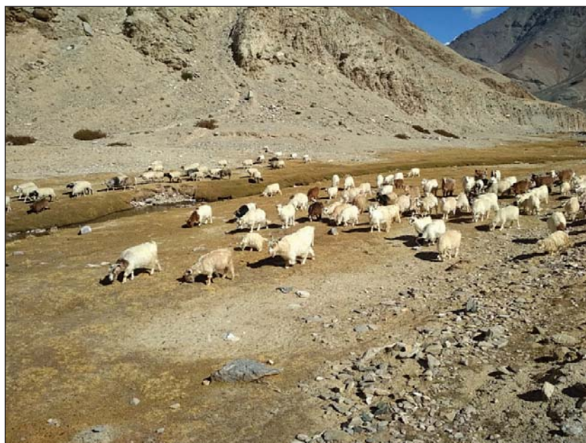
Fig. 6. Typical herd of Changthangi goat in Changthang area of Ladakh

double hair coat; outer coat of long course hair and inner coat of shorter fine hair. The inner fine hair is used to produce world’s finest pashmina fibre and most costly animal fiber with an average fineness of 11–13 micron. The colour of the hair is generally white but other variants such as black or brown also exist in some animals. These goats play major role in sustaining the economy of local nomadic people as these provides fine quality wool to make famous pashmina shawls which is of high demand both in national as well as international market. These goats are also used as a source of meat, skin and manure. A typical moving herd of Changthangi goat is shown in Fig. 7.